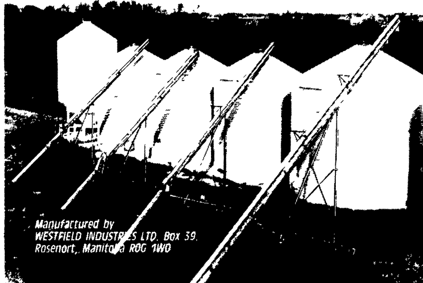
Manufactured by WESTFIELD INDUSTRIES LTD. Box 39, Rosentort, Manitoba R0G 1W0

But did you know that we're probably North America's leading grain auger manufacturer. We really know our stuff. We offer a choice of 6, 7, 8, or 10 inch diameters; lengths from 26 to 71 feet; and four drive options — electric, gas, PTO shaft or PTO belt drive. Our new labor saving 'TR' series — the PTO auger with hydraulic positioning — lets your tractor do the hard work. And we carry a large inventory, at all times, for fast delivery. There's a lot behind the Westfield name and reputation. And an auger by any other name just might not measure up.