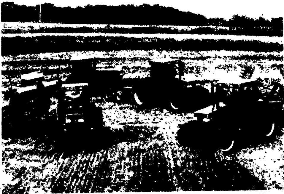
Case IH has introduced the all-new 7100 Series tractors, called the Magnum line, featuring a totally new engine, transmission and cab. The Magnum line of two-wheel-drive tractors in the 130 to 195 PTO horsepower range represents a totally new approach to tractor design and manufacturing, inspired by the 1985 merger of J I Case and International Harvester.