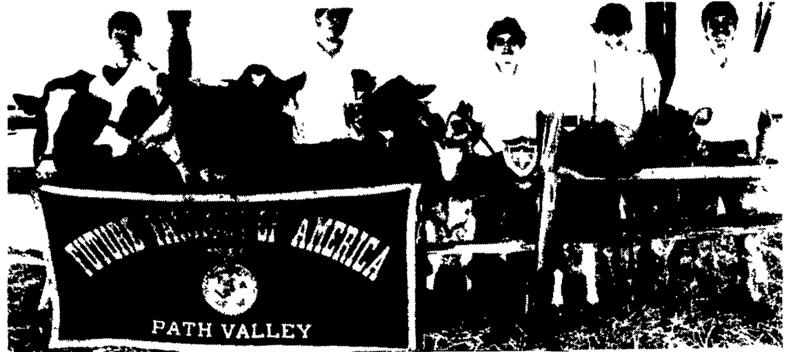
Members and animals of the Path Valley FFA who were Chapter Good Housekeeping Award winners.