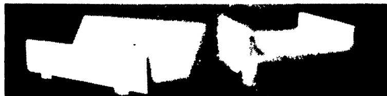
SLANT BACK J BUNK

You Spend A Lot Of Time And Money Producing And Storing Your Good Feed Crops. Don't Just "Get By" With A Feeding Bunk That Wastes Feed Or Is About Worn Out. Your Best Choice For A Feed Bunk Is Pre-Cast Concrete.