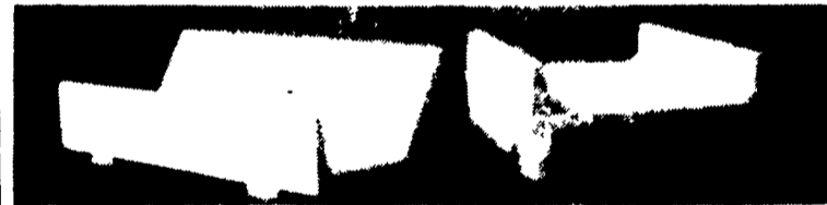
SLANT BACK J BUNK

You Spend A Lot Of Time And Money Producing And Storing Your Good Feed Crops. Don't Just "Get By" With A Feeding Bunk That Wastes Feed Or Is About Worn Out. Your Best Choice For A Feed Bunk Is Pre-Cast Concrete.