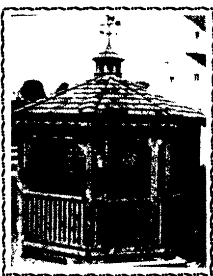
Built On A Farm For You Farmers

A Nice Way To End your Day - Relax In A Gazebo