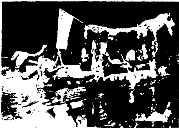
The boat race entry from the Virgenville 4-H Club was "Moo Moo Express," at the Berks County Dairy Festival.