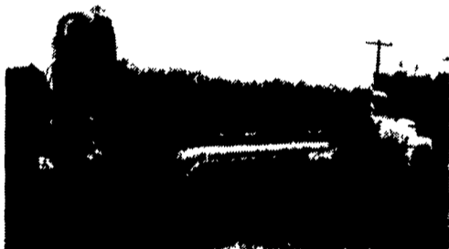
Int. Diesel with 18 Ft. Sprout Feed Tank And Pickup Unit... $11,500