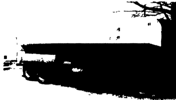
Sprout-Waldron Tandem Axle Bulk Feed Trailer With Self Contained Engine And Blower Equipment $8,900 Now $6,900

USED TANKS AND VANS Contact Us Today For Close-Out Specials PRICES START AT $1,500