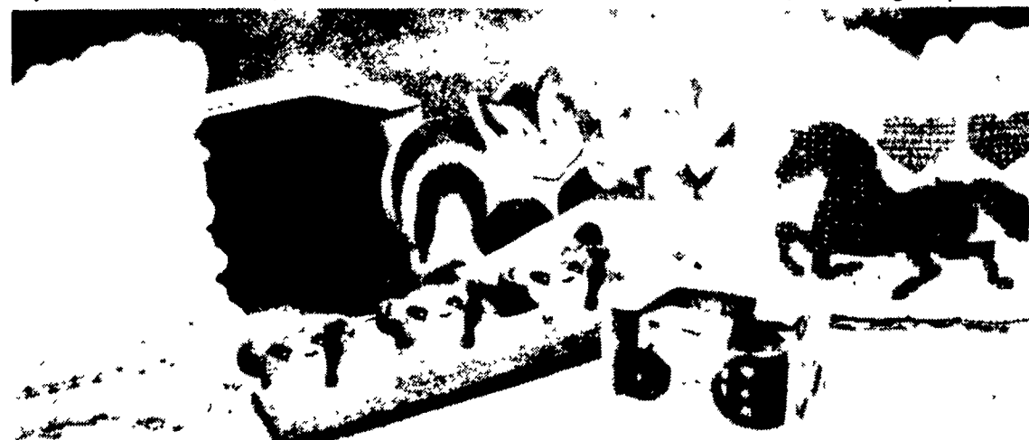
This is a sampling of some of the many items which will be sold to benefit Lancaster County 4-H'ers at the benefit auction to be held on August 19 at Solanco Fairgrounds in Quarryville. In addition to the tractors, and crossstitched pillows, there are a wide variety of wooden crafts being offered.