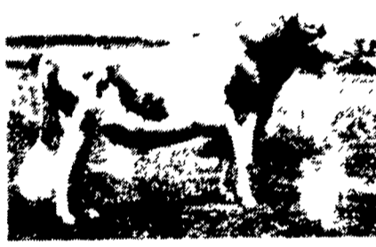
21G247 Dutch Mill Telestars FAYETTE