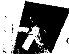
Wall Fan w/Hood & Painted Galvanized Cabinets