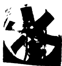
Belt Drive Panel Fan

All Types Of Fans For All Types Of Buildings - Sizes 20" to 48" Available -