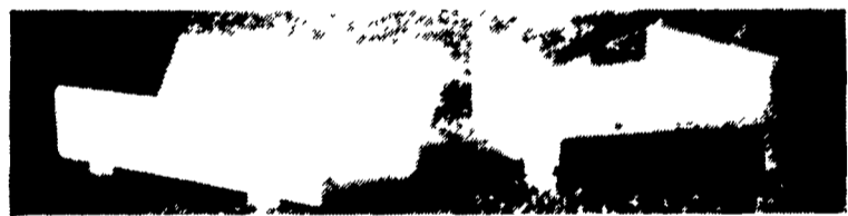
SLANT BACK J BUNK

You Spend A Lot Of Time And Money Producing And Storing Your Good Feed Crops. Don't Just "Get By" With A Feeding Bunk That Wastes Feed Or Is About Worn Out. Your Best Choice For A Feed Bunk Is Pre-Cast Concrete.