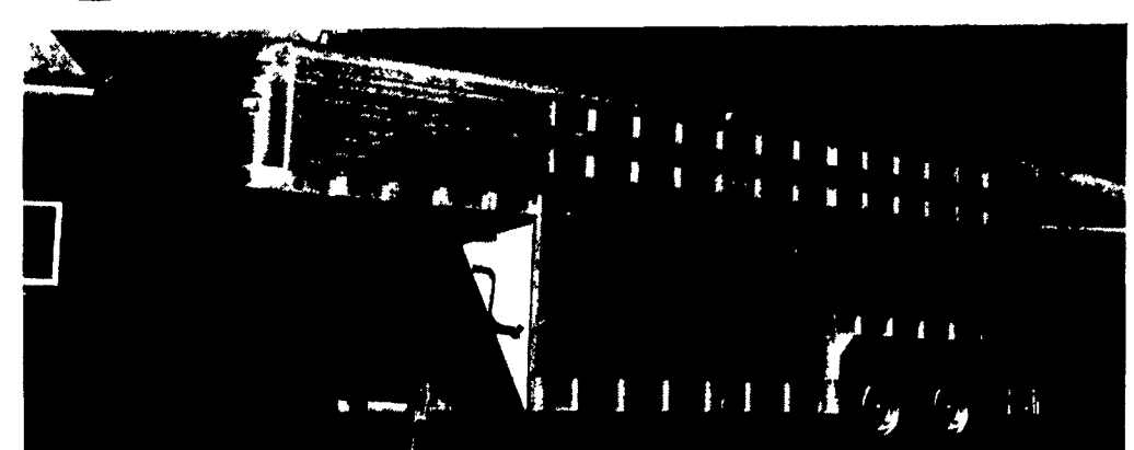
20' Gooseneck Trailer

A versatile, lightweight, Eby aluminum stock trailer is built to provide years of maintenance free service. An Eby trailer is custom built to fit your individual hauling needs - No mass production! We use only quality components and strong alloy aluminum to manufacture what may be the last trailer you'll ever buy.