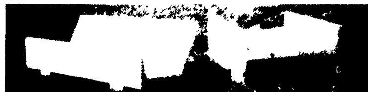
SLANT BACK J BUNK

You Spend A Lot Of Time And Money Producing And Storing Your Good Feed Crops. Don't Just "Get By" With A Feeding Bunk That Wastes Feed Or Is About Worn Out. Your Best Choice For A Feed Bunk Is Pre-Cast Concrete.