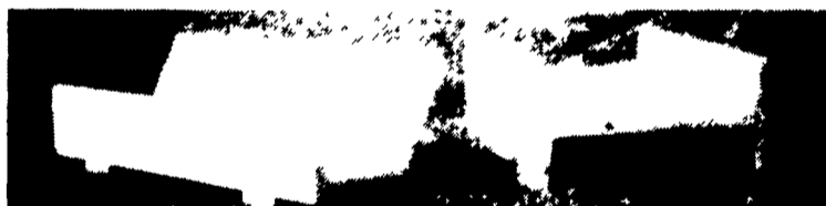
SLANT BACK J BUNK

You Spend A Lot Of Time And Money Producing And Storing Your Good Feed Crops. Don't Just "Get By" With A Feeding Bunk That Wastes Feed Or Is About Worn Out. Your Best Choice For A Feed Bunk Is Pre-Cast Concrete.