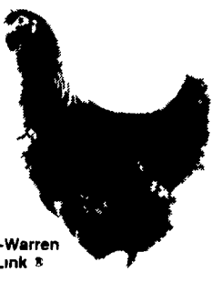
DEKALB Warren Sex-Sal-Link

Proving herself year after year under varying conditions. High performance.