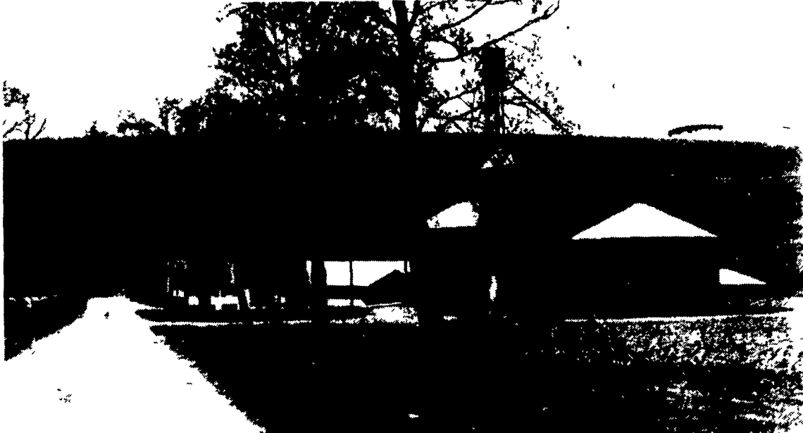
The White's grain farm is located in Muncy near the Lycoming Mall.

"I don't want to be cooped up in a restaurant," she says. "I want to be outdoors doing plant work or working with machinery and feeling the accomplishment... and not stuck on an assembly line job."