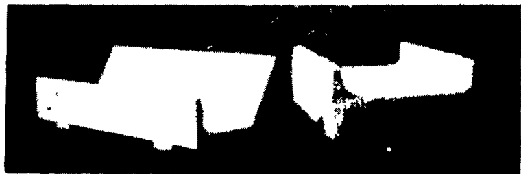
SLANT BACK J BUNK

You Spend A Lot Of Time And Money Producing And Storing Your Good Feed Crops. Don't Just "Get By" With A Feeding Bunk That Wastes Feed Or Is About Worn Out. Your Best Choice For A Feed Bunk Is Pre-Cast Concrete.