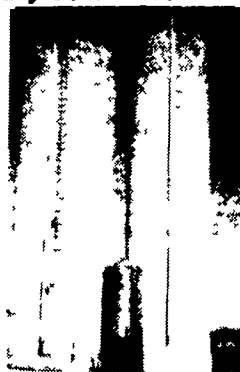
24'x75' 20'x80' Groland Farm - The Groves Shippensburg, PA

Don't Delay Too Long! Our Schedule For 1987 Is Rapidly Filling Up.