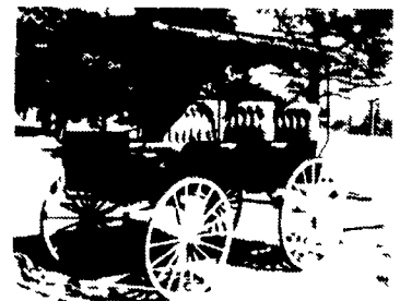
Three Seat Democrat