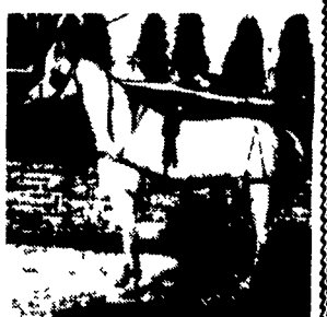
Harness Makers Horse

Carriage & wagon parts including wheels, poles, shafts, seats, etc; prim. & blacksmith tools; wagon jacks; tie weights; sev. water cooled, gas engines; runing gears; sev. old wooden broom makers; h.d. farm machinery; dog treadmill & the list goes on and on.