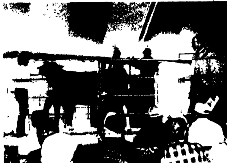
Ring action turned extra lively as sale headliner Weim-Sharr-J Electra Delight went on the block. After a round of heated bidding, she went under the gavel for $4,500 to Rodney Greist, Coatesville.

At least 15 Excellent cows were bred or developed from the Weim-Sharr herd over the past eight years; and two Excellents, 17 Very Goods and 23 Good Plus in-