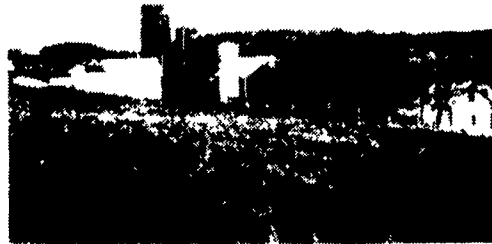
Tract 1-85 acre farm

Both located along Rt. 183 between Bernville and Strausstown, Jefferson Twp., Berks Co., Pa. Traveling on Rt. I-78 between Allentown and Harrisburg turn off Exit 7 onto Rt. 183.