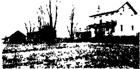
Tract 2-54 acre farm

Tract 1- 85 acre dairy farm, more or less, with gentle rolling land, blacktop road frontage and a stream running through the property whereon is erected a lg. banked barn w/36 stanchions, breeding stalls, pipeline milking w/1500 gal. milk tank and barn cleaner, 2 pole sheds 1 for housing approx. 50 cows and 1 for approx. 80 cows, a lg. 2 story storage shed w/grain bins, a 2 story shed w/heifer pens, a lg. dbl. corncrib shed, a 20'x60' harvester, a 25'x80' harvester, a 20'x40' cement silo, feed bunk area, a 50'x100' steel equipment shed and a 2 1/2 story framed home w/1/2 bath on the first floor, 4 bedrooms and bath on the second floor. The home is heated by a comb. coal/wood stove, there also is an attached 2 story summer house.