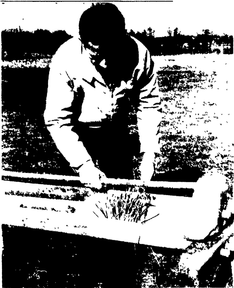
Nornhold demonstrates how to use a flax brake. The brake breaks the outer fiber of the flax stem into small pieces.