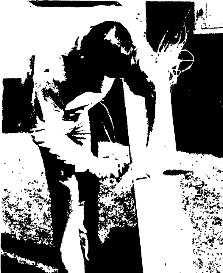
Nornhold scutches flax that has just come from the flax brake. Scutching removes most of the outer fiber or hull of the flax plant.

The next meeting will be held April 28 at the Extension building.