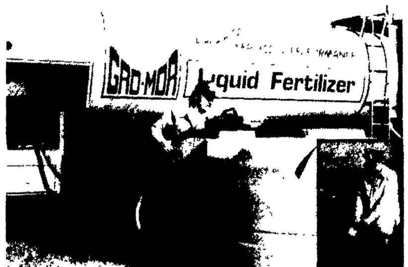
Gro Mor makes on farm delivery so you have fertilizer when you need it. Inset shows Gro Mor technician preparing soil sample.