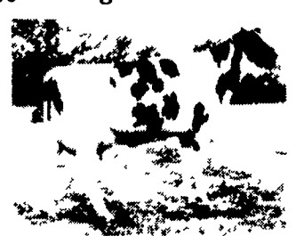
Faye-Anne Baltimore Cricket