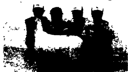
(1985 Lebanon Area Fair Grand Champion)

"The Only Sale by the Youth for the Youth"