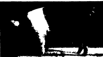
(1st Wt. Champ 1987 PA Farm Show)