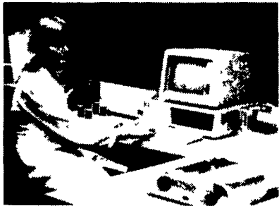
NIR provides fast and accurate forage results.