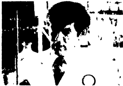
Wet chemistry is used to insure NIR accuracy.