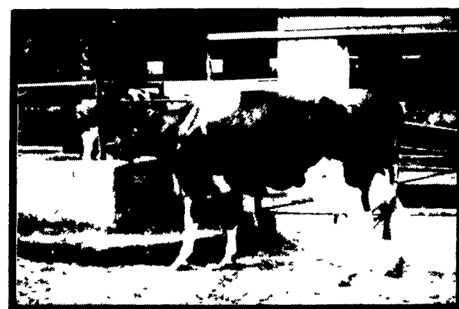
MEL-AIRE PROMIS STAR 3E-91

The Donna Family - High Producing, High Scores