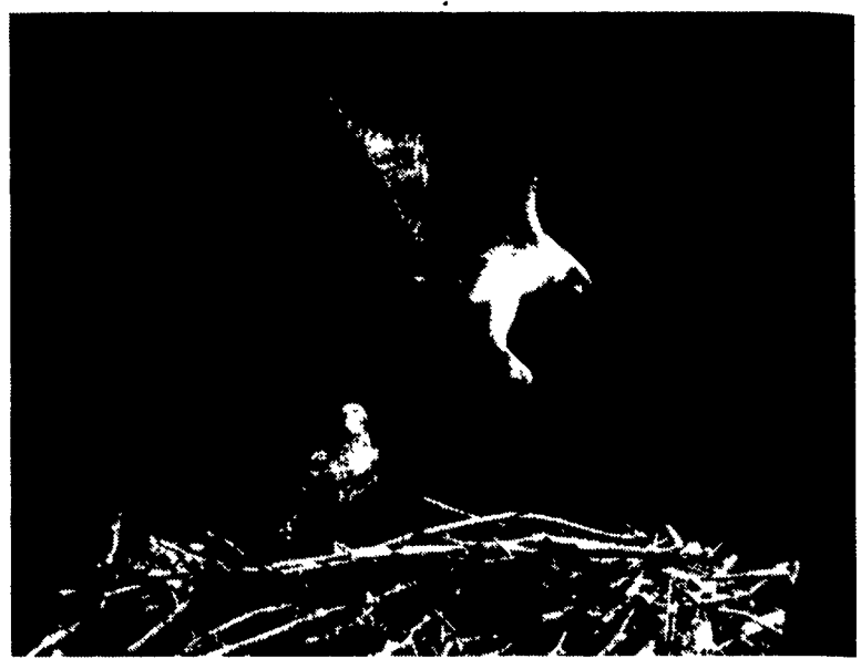
A Pennsylvania-born osprey watches as its nest mate tests its landing skills. Four chicks were hatched last year, and scientists look forward to more nesting success this year.

The program began in the summer of 1980 with the translocation of six young osprey from the Chesapeake Bay. To date 111 osprey chicks have been reared in the Pocono hacking towers. For the time being translocation of osprey chicks has been stopped. Everyone is hopeful that natural reproduction will increase in years to come as the hacked chicks