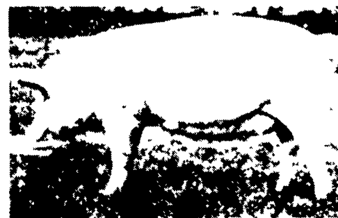
Pennsylvania's Record Selling State Sale Bred Gilt

Handmated - due April 23 thru June. Mostly sired by & carrying service to top test station boars. Bred for purebred and crossbred litters. Yorkshire Gilts carrying service to "SMITHSONIAN", champion boar National boar test.