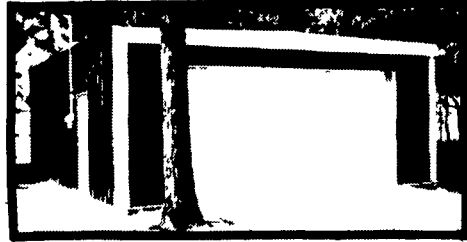
FARMSTEAD® II GARAGE