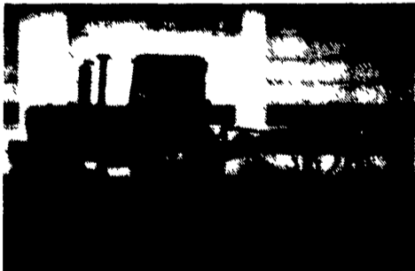
John Deere 4440

Location: RD#1 Marietta, Lancaster County, Pa. From Route 30 take Columbia Exit, Route 441 North to second red light right on Route 743 North approx. 3 miles left on Donegal Springs Rd. From Route 283 off on Elizabethtown/Hershey Exit, take Route 743 South for approx. 7 miles. Right on Donegal Springs Rd. Look for Signs.