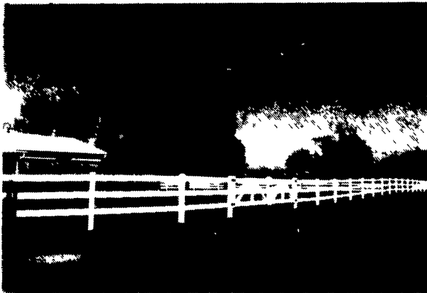
3-Rail Fence w/Gates "Never Need Paint" P.S. Polyvinyl will not rot, splinter, chip, etc.