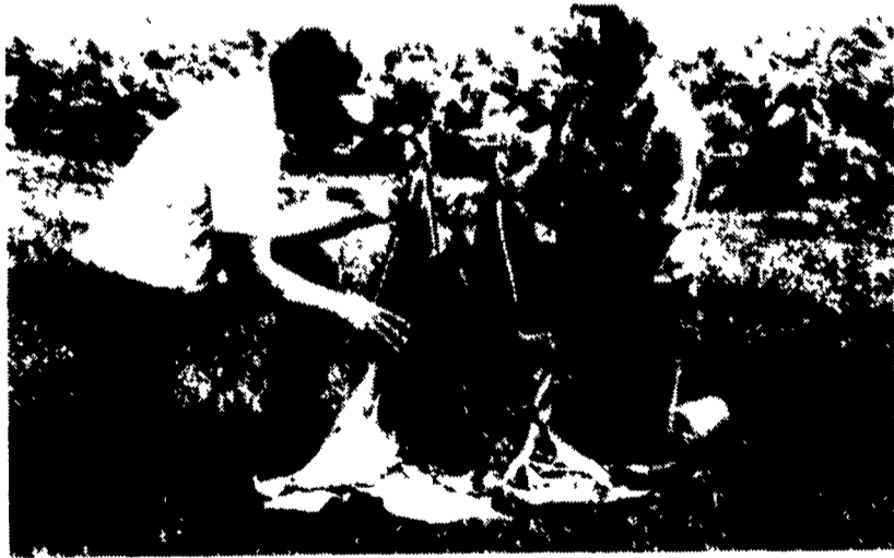
Tobacco grown with Gro-Mor's tobacco program shows remarkable value

To obtain this worksheet, contact your local extension office at Newark (451-2506), Dover (697-4000) or Georgetown (856-7303).