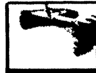
3 POINT SCRAPER