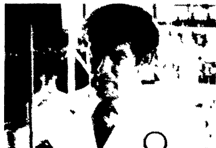
Wet chemistry is used to insure NIR accuracy.