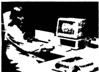
NIR provides fast and accurate forage results.