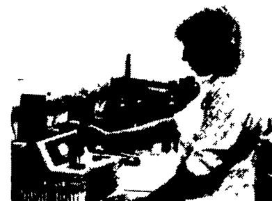
Forages and water samples are checked for the presence of nitrates when requested.