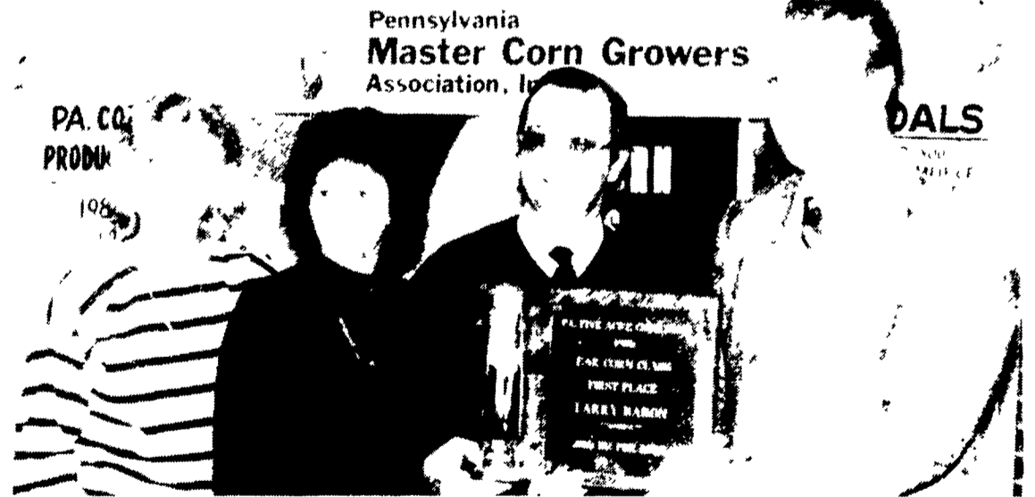
Pennsylvania Master Corn Growers Association, Inc.