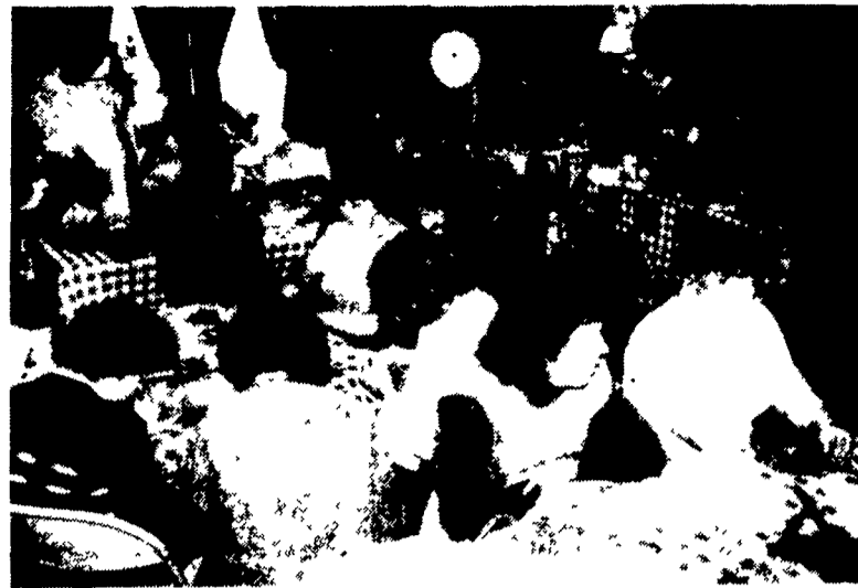
The Strawberry Patch offers about 75 classes each semester. Here, students work at constructing rope baskets.