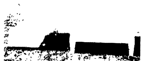
SLANT BACK J BUNK

You Spend A Lot Of Time And Money Producing And Storing Your Good Feed Crops. Don't Just "Get By" With A Feeding Bunk That Wastes Feed Or Is About Worn Out. Your Best Choice For A Feed Bunk Is Pre-Cast Concrete.