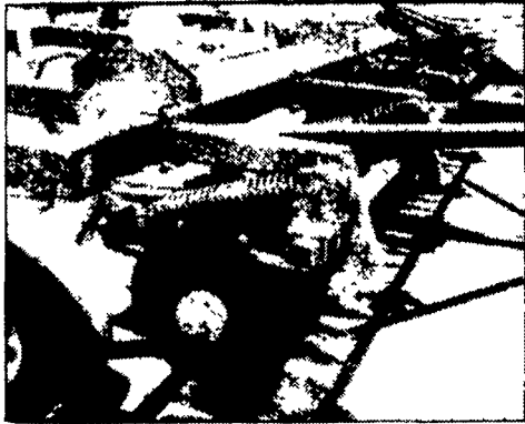
Hydraulic coultter assembly features spring-mounted bearing arms to flex over buried rocks.

All the Soil Conservation people are talking about combining subsoiling while you chisel plow. Krause has done just that.