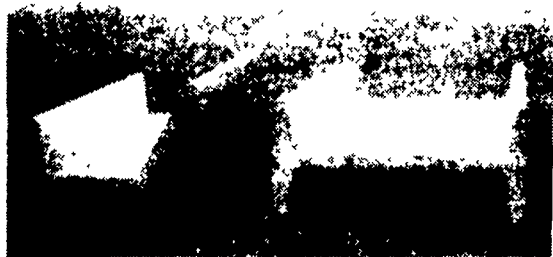
SLANT BACK J BUNK H-BUNK

You Spend A Lot Of Time And Money Producing And Storing Your Good Feed Crops. Don't Just "Get By" With A Feeding Bunk That Wastes Feed Or Is About Worn Out. Your Best Choice For A Feed Bunk Is Pre-Cast Concrete.