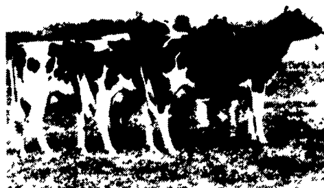
Best Three Females Owned by Windsor Manor Farm.