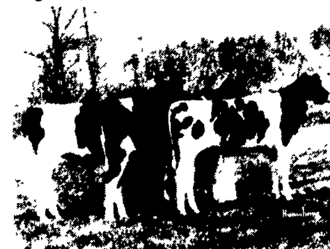
Jr. Best Three Females Owned by Savage-Leigh Farm.