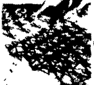
Connecting front and rear sections of Hercules Harrow