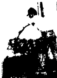
Easy to use, handle, store

All models section alized for ease of handling. Sections roll up for compact storage, transport. All FUERST Harrows easily assemble/disassemble without tools if ever needed, parts readily available.