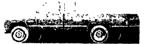
#7159 C-10 Pick-Up, 8 Ft. Bed V-6 3 Speed PS and More '8,595 00