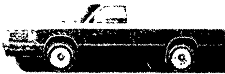
#7072 S-10 Pick-Up 4 Cyl., 4 Speed '6588 00

Over 250 New and Used Trucks In Stock For Immediate Delivery