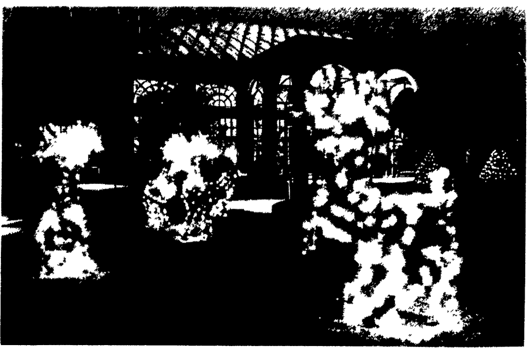
Lighted reindeer are a specialty of the Christmas display at Longwood Gardens, Kennett Square, Pa. These figures are but a small part of the outdoor Christmas lighting, which includes 35,000 lights in a rainbow of colors.