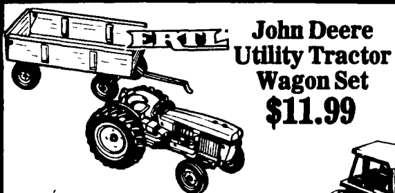
Die Cast Mini Tractors