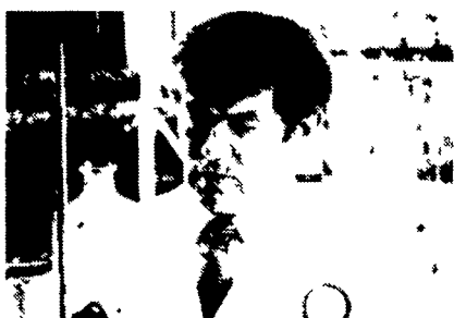
Wet chemistry is used to insure NIR accuracy