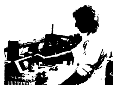
Forages and water samples are checked for the presence of nitrates when requested.