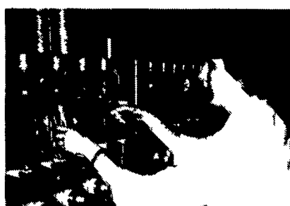
ADF (acid detergent fiber) and NDF (neutral detergent fiber) are used to determine available energy from forages.