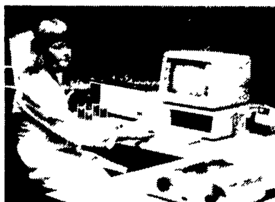
NIR provides fast and accurate forage results.