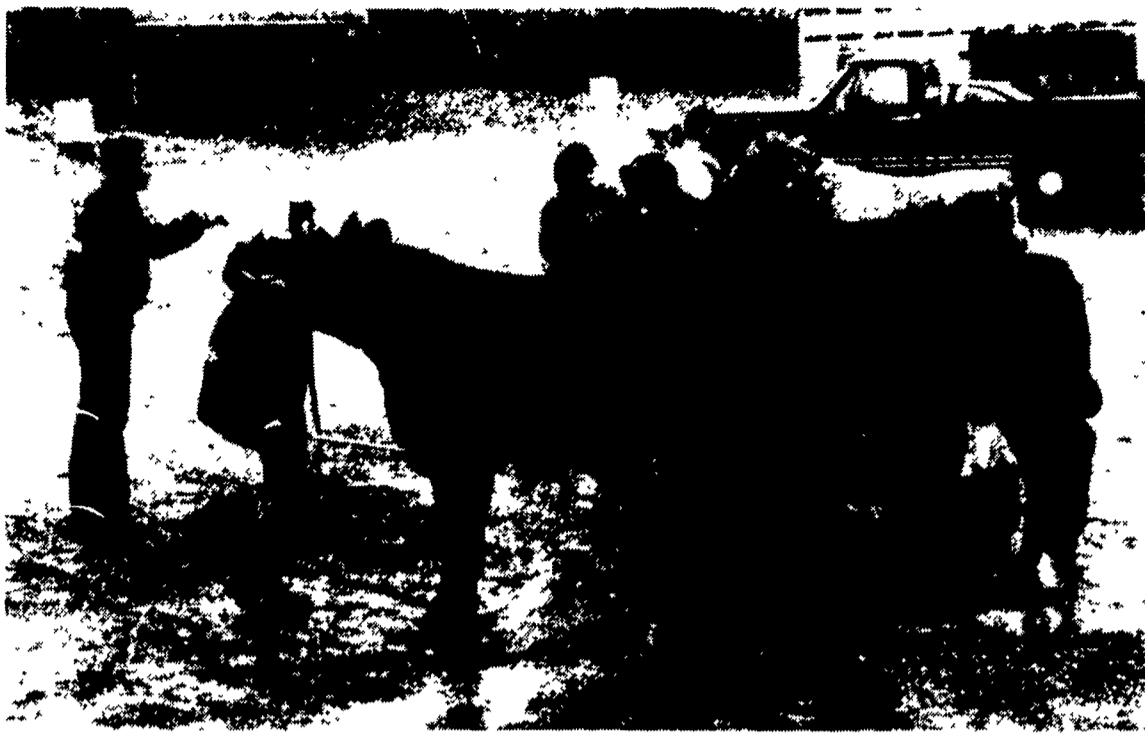
Foul weather didn't stop these Cumberland County 4-H'ers from showing their steers at the county's annual roundup.

Other buyers included Souder's Feed and Grain, the Country