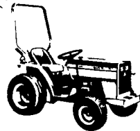
M-F 1010 Hydro

Trim up to $1200 off our best price on Massey-Ferguson tractors