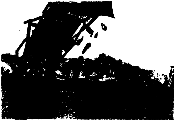
Carrots fall from the conveyor into a potato wagon.

heavy urea application during soil preparation prior to planting. After the plant shows green, precautions are taken to control leaf hoppers and blight. From mid-July until harvest, the crop is sprayed every ten days to two weeks. Subsequent nitrogen applications during plant growth aids in strong top and vegetable development.