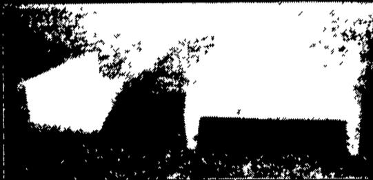
SLANT-BACK J-BUNK H-BUNK PRE-CAST CONCRETE FEED BUNKS

You Spend A Lot Of Time And Money Producing And Storing Your Good Feed Crops. Don't Just "Get By" With A Feeding Bunk That Wastes Feed Or Is About Worn Out. Your Best Choice For A Feed Bunk Is Pre-Cast Concrete.