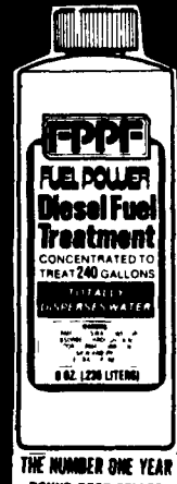
THE NUMBER ONE YEAR ROUND BEST SELLER

6030 Jonestown Rd., Harrisburg, Pa. 17112 717-545-5931 Interstate 81 Exit 26